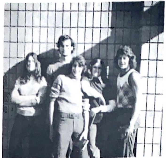
(The Cast; Ganging Up!)

The play, performed in late November, will run three nights at a cost of $1.50 for general admission and 75 cents for A.S.B. sticker holders. Don't miss it.