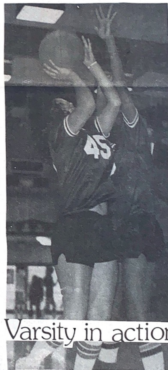
Varsity in action

This year the varsity team looks pretty good, but it will have a tough pre-season. The first pre-season game is March 1, and it's against a hard Bishop O'Dowd team from Oakland. Last year O'Dowd took second place in the Catholic Athletic League, so it should be a good game. There will be 13 games played at American, we would like to see you out there to support the team, and I know the players would appreciate it. Most all of the games will start at 3:30, except for one Saturday game. It will start at 11:00. The N.C.S. Regional Finals are going to be held on May 26, 27, 28. And on June 3, 4 are the Northern California Championship, and we're all hoping for our team to be in them.