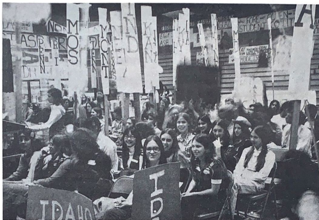
(Students pause for a moment during the hectic convention to smile for the camera. Notice the great decorations.)